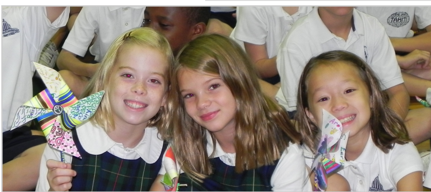
Students gather for prayer during Pinwheels for Peace Day