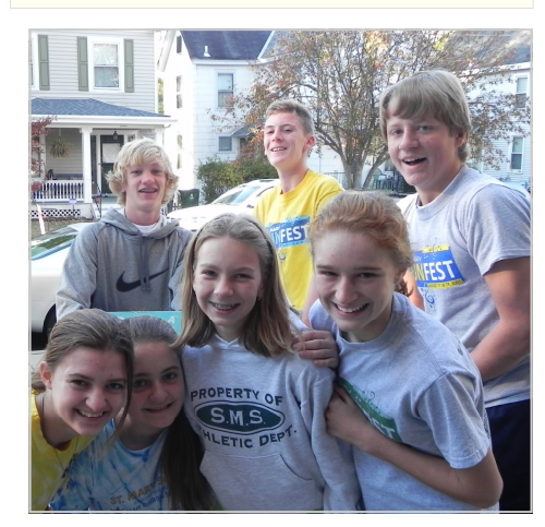
Jr. High students pose for a photo during a food drive for St. Vincent De Paul